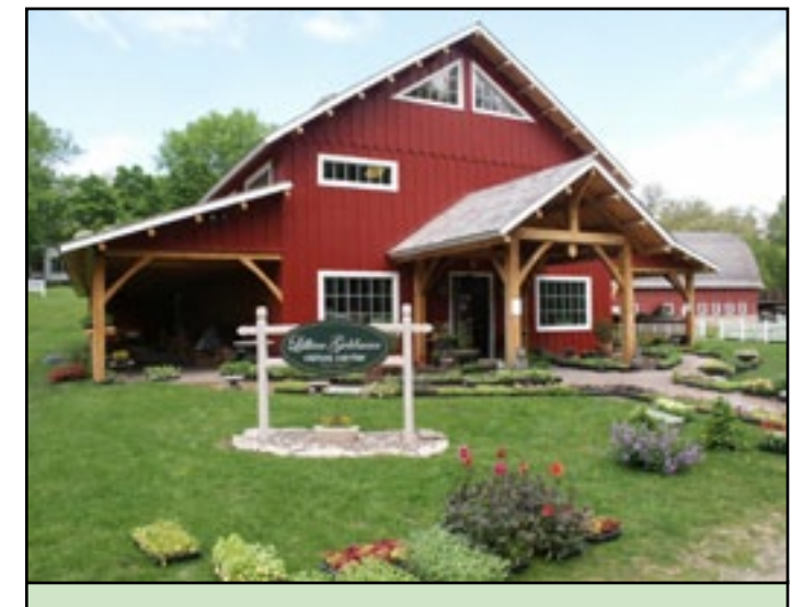
Above and left: The Heritage Farm barn was restored by Amish carpenters and serves primarily as a conference center in the summer and a storage facility in the winter. The Lillian Goldman Visitors Center houses educational displays, artwork, and the Seed Savers store, and also provides sheltered space on its dual side porches for festive outdoor events.

Along with several thousand vegetable varieties preserved by regular grow-outs at Heritage Farm and